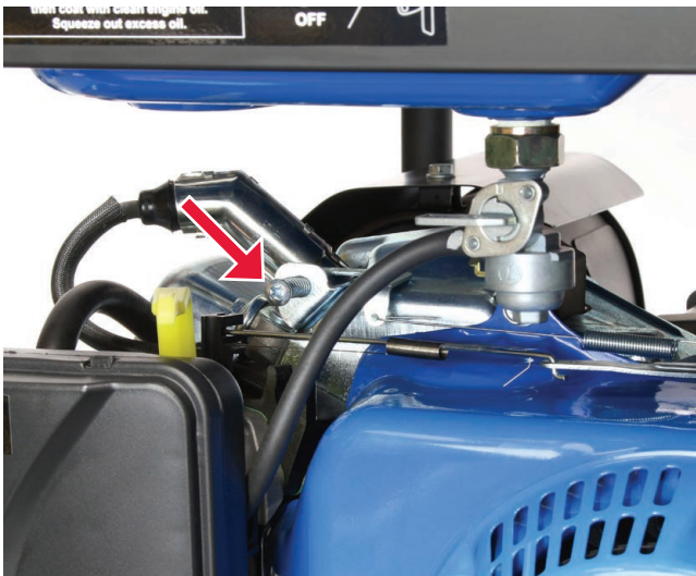
3750 & 3750-PRO